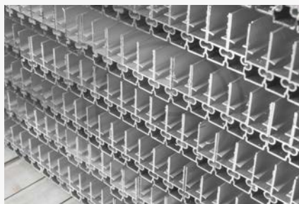
Extruded Aluminium Profiles