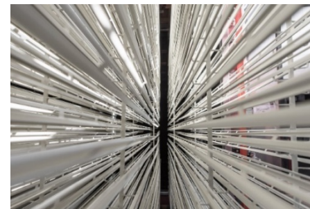
Cut & Aging